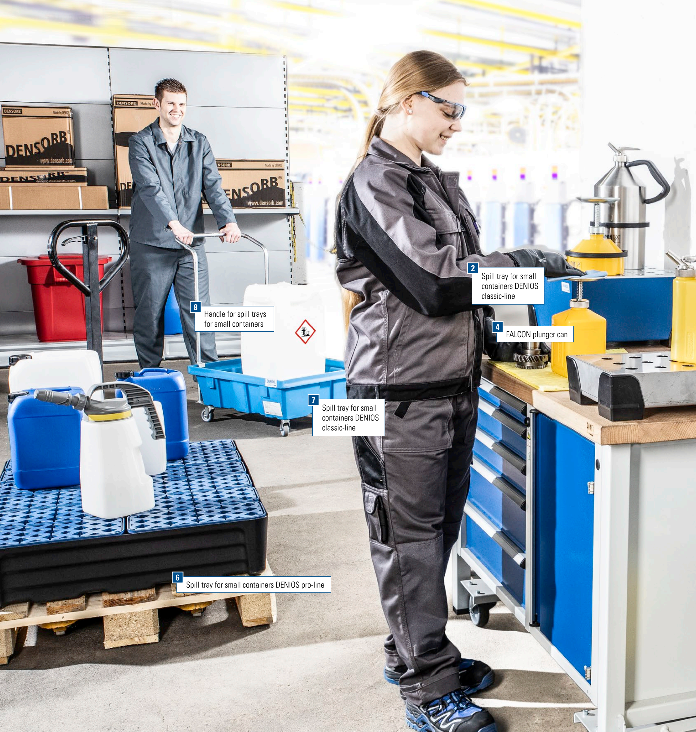
8 Handle for spill trays for small containers