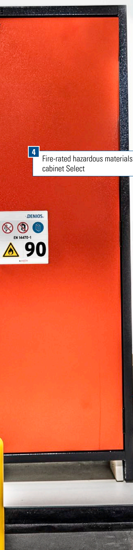
4 Fire-rated hazardous materials cabinet Select

The selection of a hazardous materials cabinet generally depends on which substance will be stored in it. Three types of substances are considered: water-polluting, flammable and aggressive. For each of these substances, DENIOS offers a wide range of hazardous materials cabinets, adapted to suit your needs.