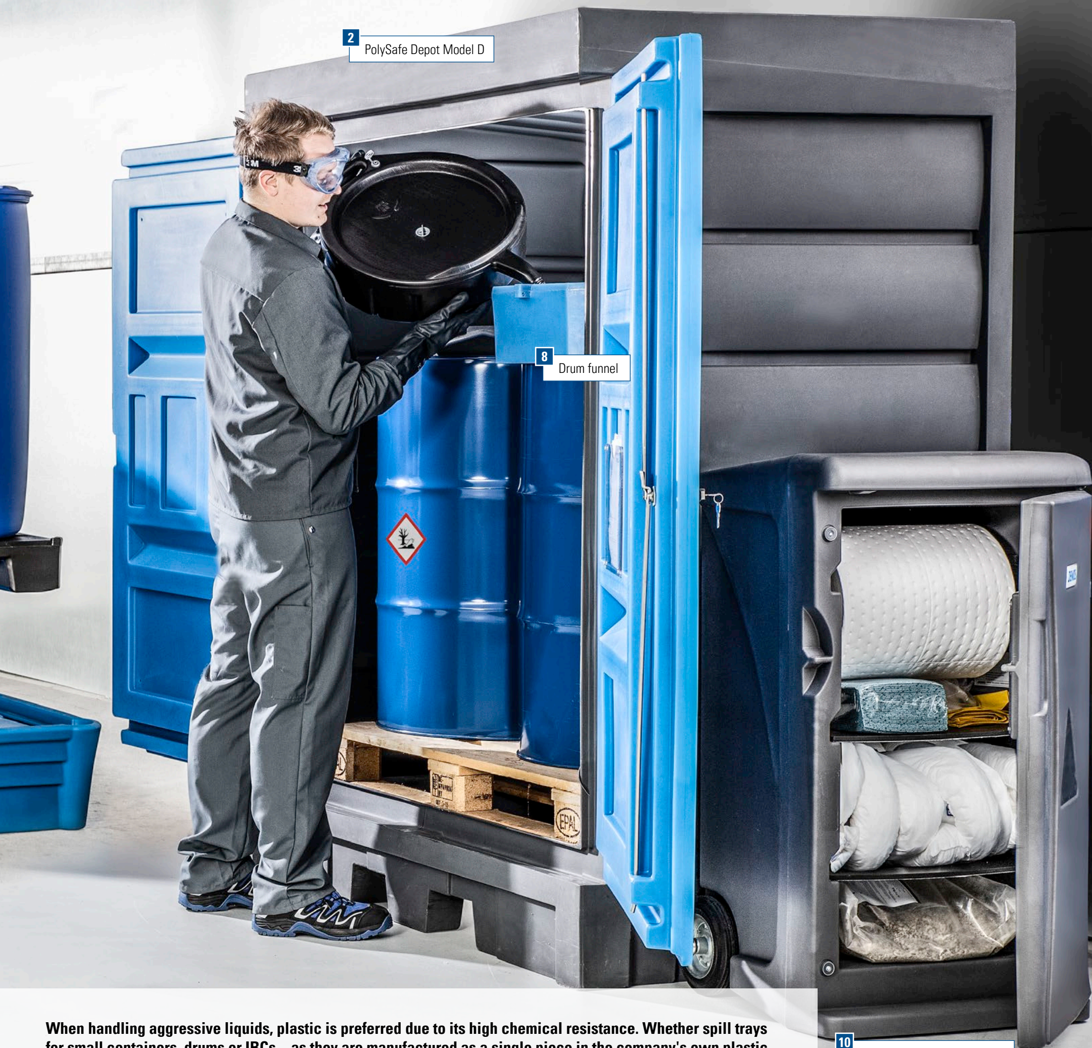
2 PolySafe Depot Model D