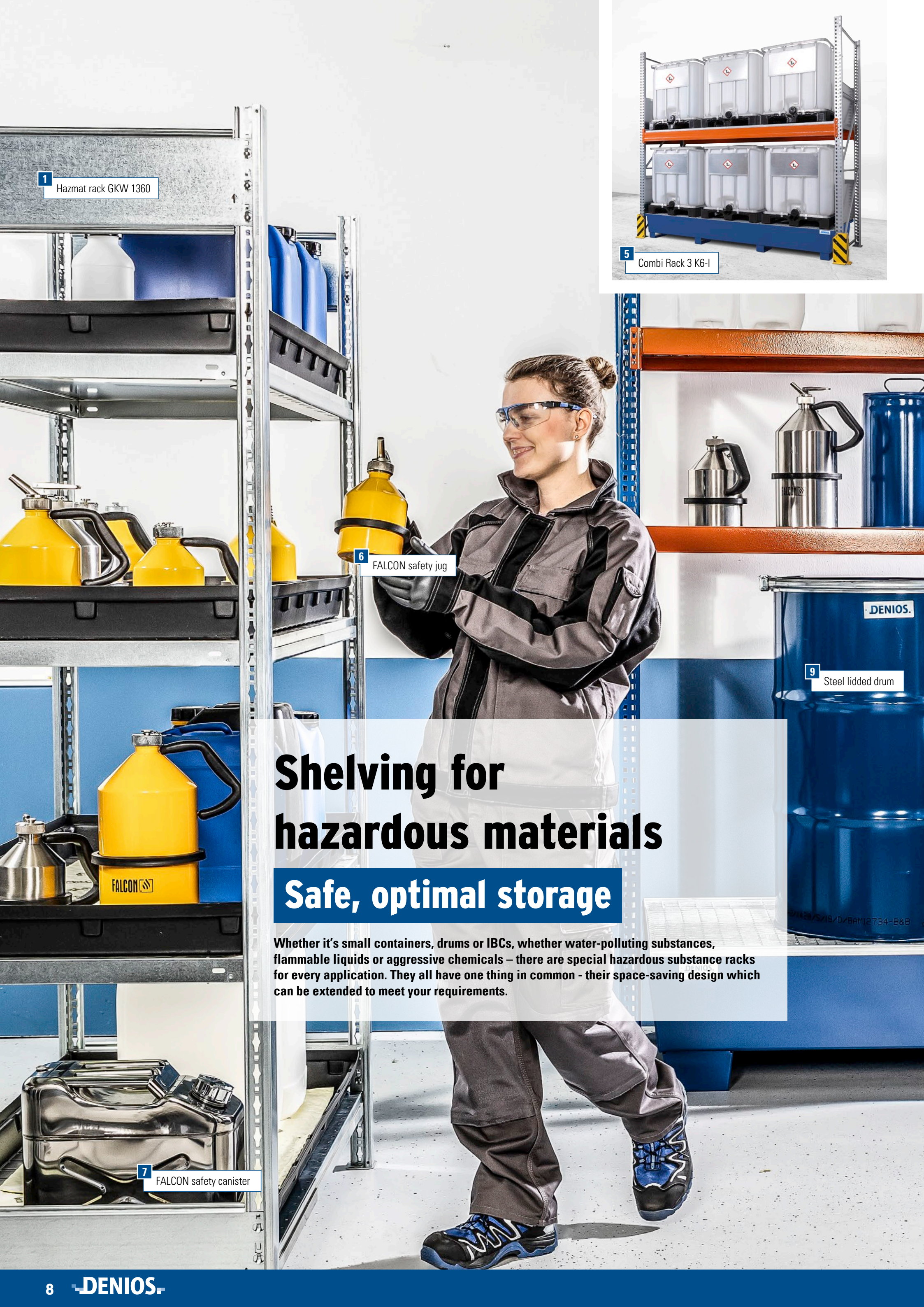
1 Hazmat rack GKW 1360