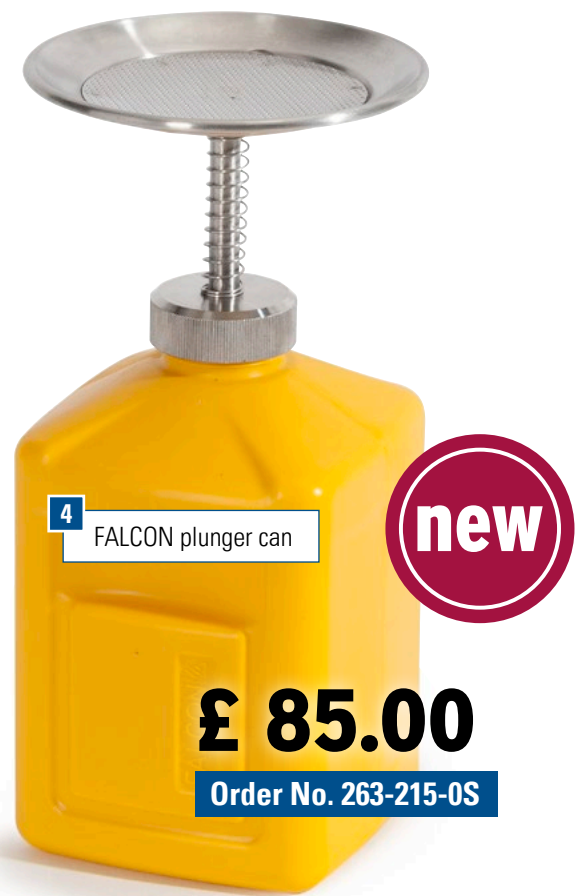
4 FALCON plunger can