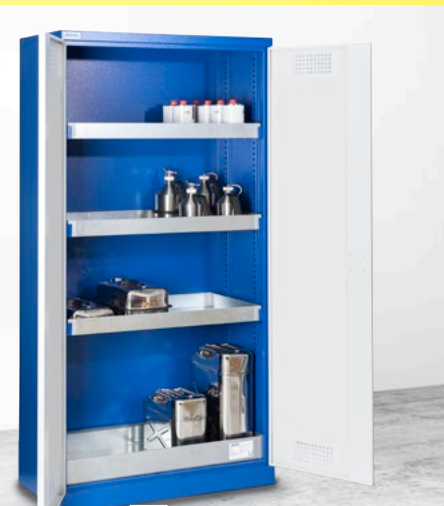
3 Chemicals cabinet Protect