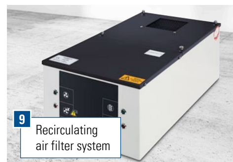
9 Recirculating air filter system

The selection of a hazardous materials cabinet generally depends on which substance will be stored in it. Three types of substances are considered: water-polluting, flammable and aggressive. For each of these substances, DENIOS offers a wide range of hazardous materials cabinets, adapted to suit your needs.