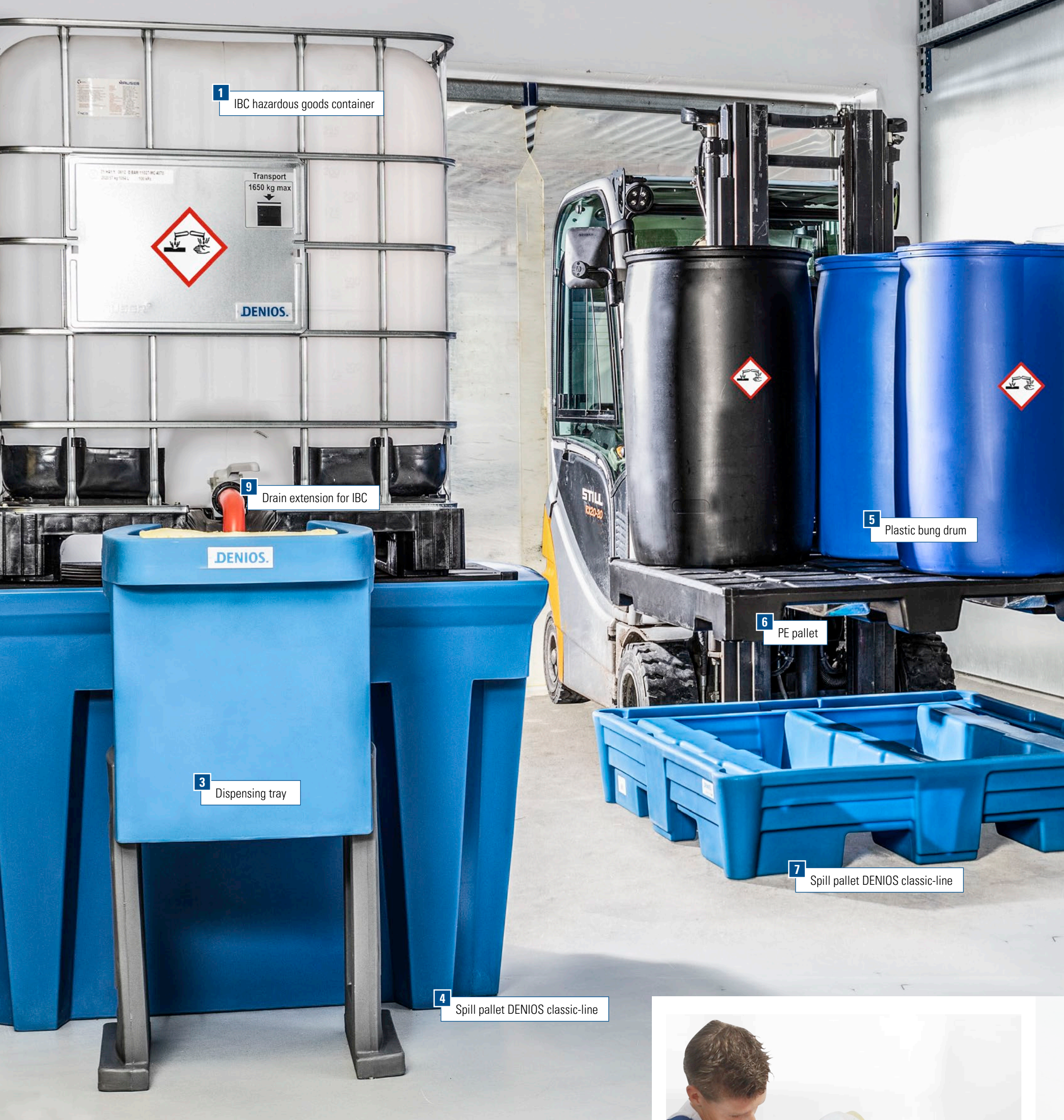
1 IBC hazardous goods container