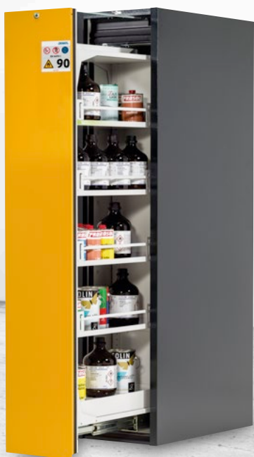
6 Fire-rated hazardous materials cabinet Slim-Scoper