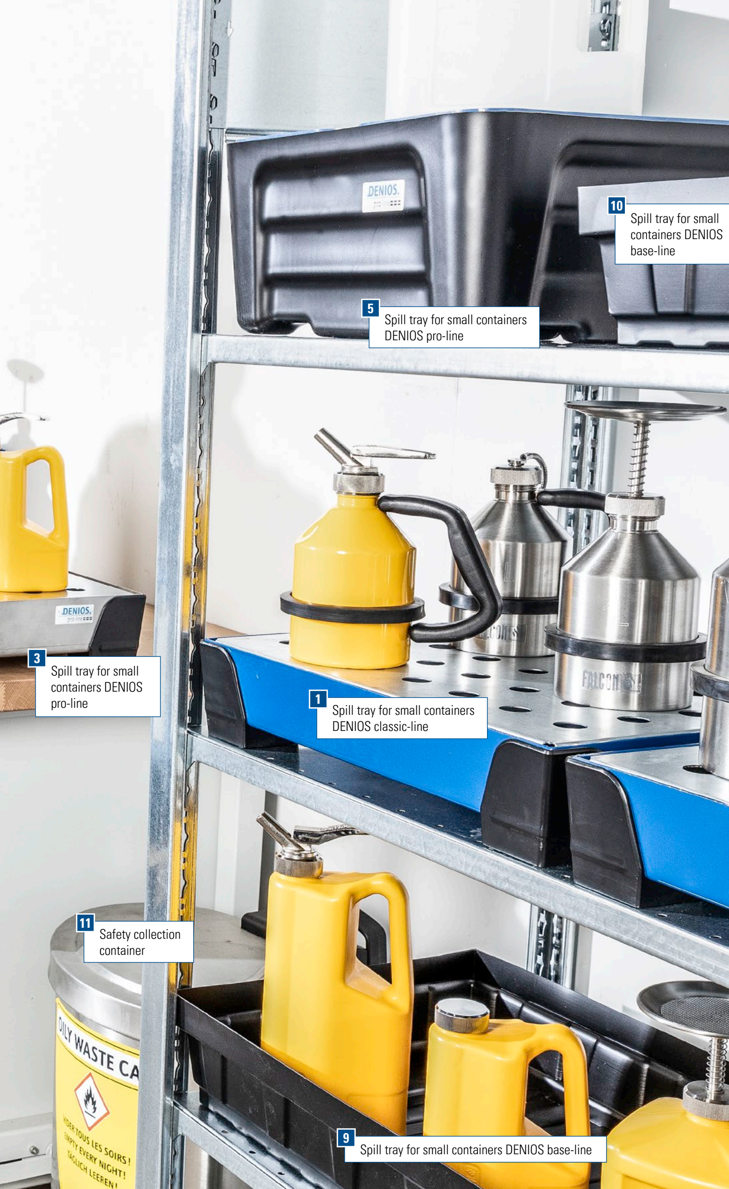
3 Spill tray for small containers DENIOS pro-line