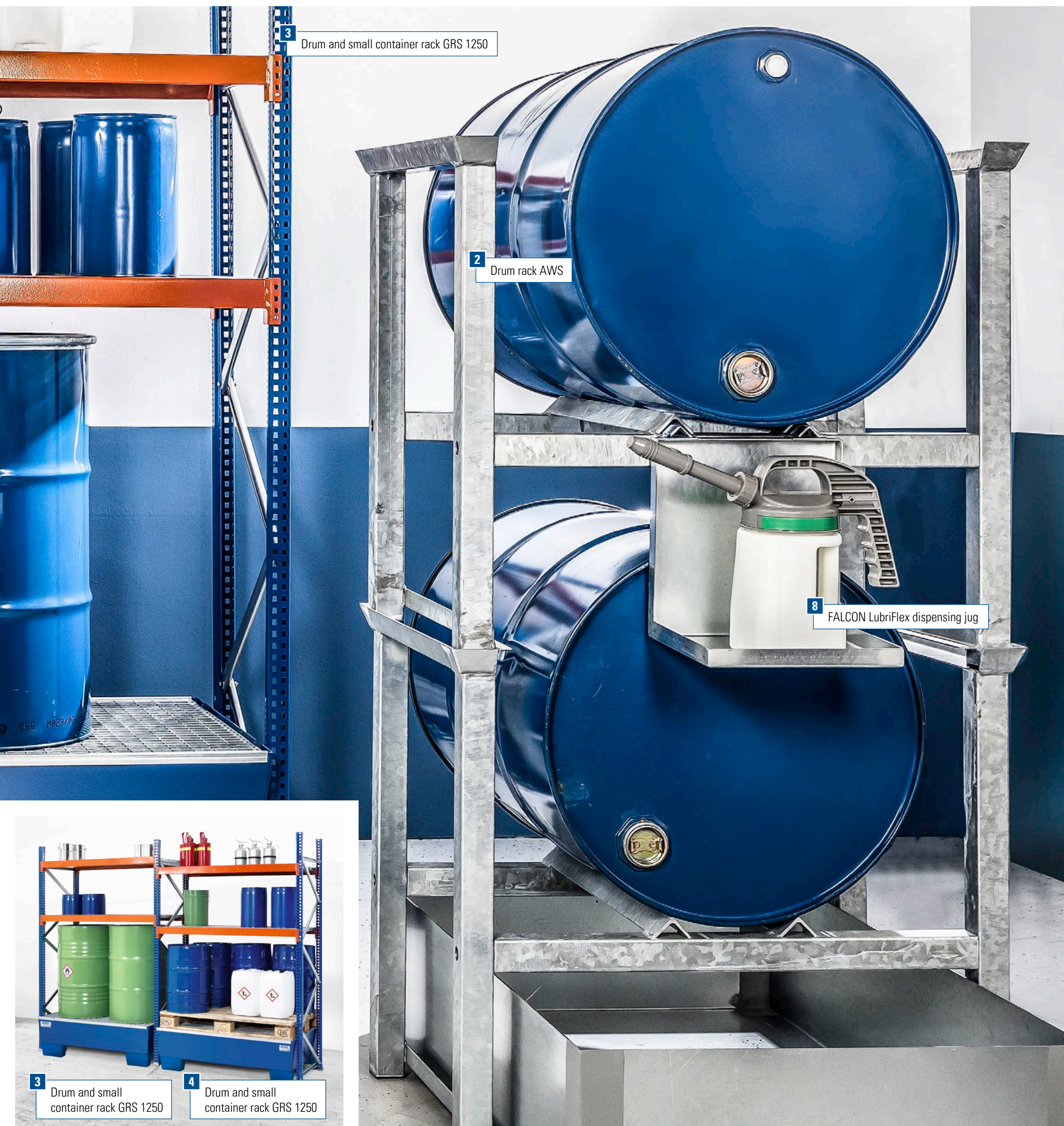
3 Drum and small container rack GRS 1250

9 Steel lidded drum 212 litres, painted inside and out, UN approval, Order No. 174-029-OS, £ 135.00 / per unit £ 129.00 / per unit from 4 units