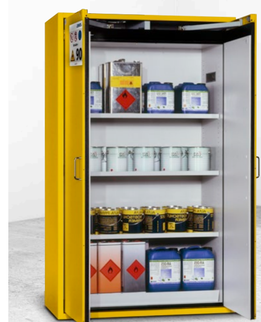
5 Fire-rated hazardous materials cabinet Edition