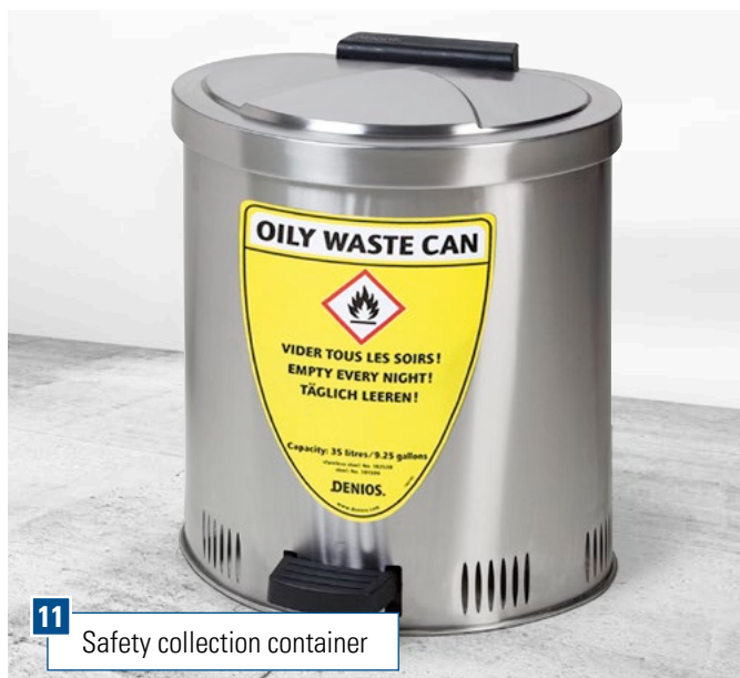
11 Safety collection container