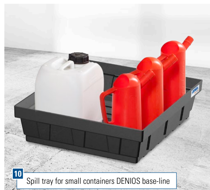
10 Spill tray for small containers DENIOS base-line

Every spill tray for small containers is extremely compact and simple to use. This ensures secure provision directly at the workplace. Key feature: thanks to their construction, they can also be used as a spill pallet for collecting drips, for example when dispensing.