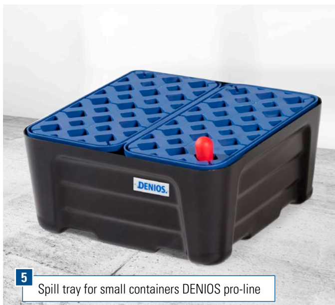
5 Spill tray for small containers DENIOS pro-line