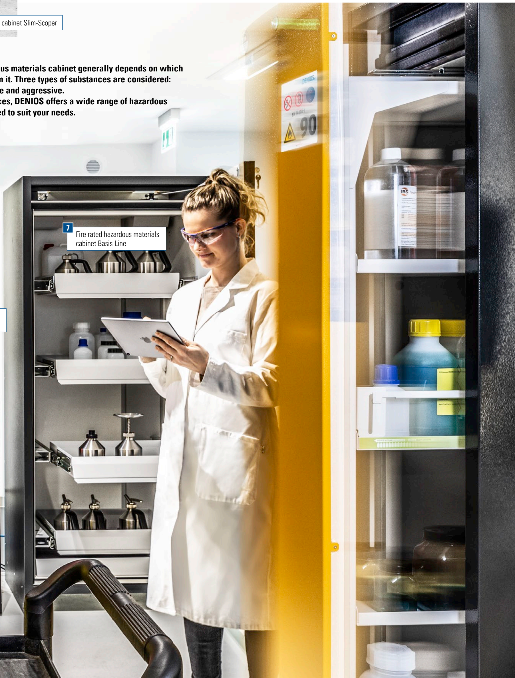
7 Fire rated hazardous materials cabinet Basis-Line