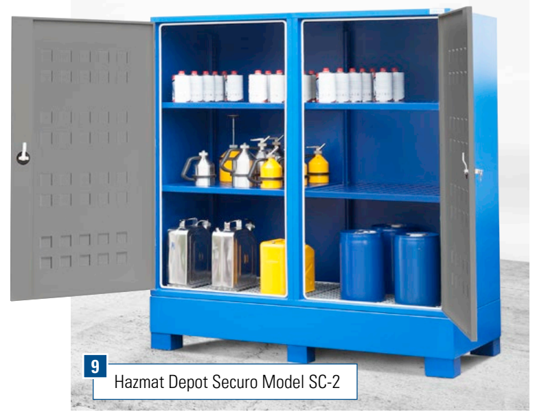
9 Hazmat Depot Securo Model SC-2