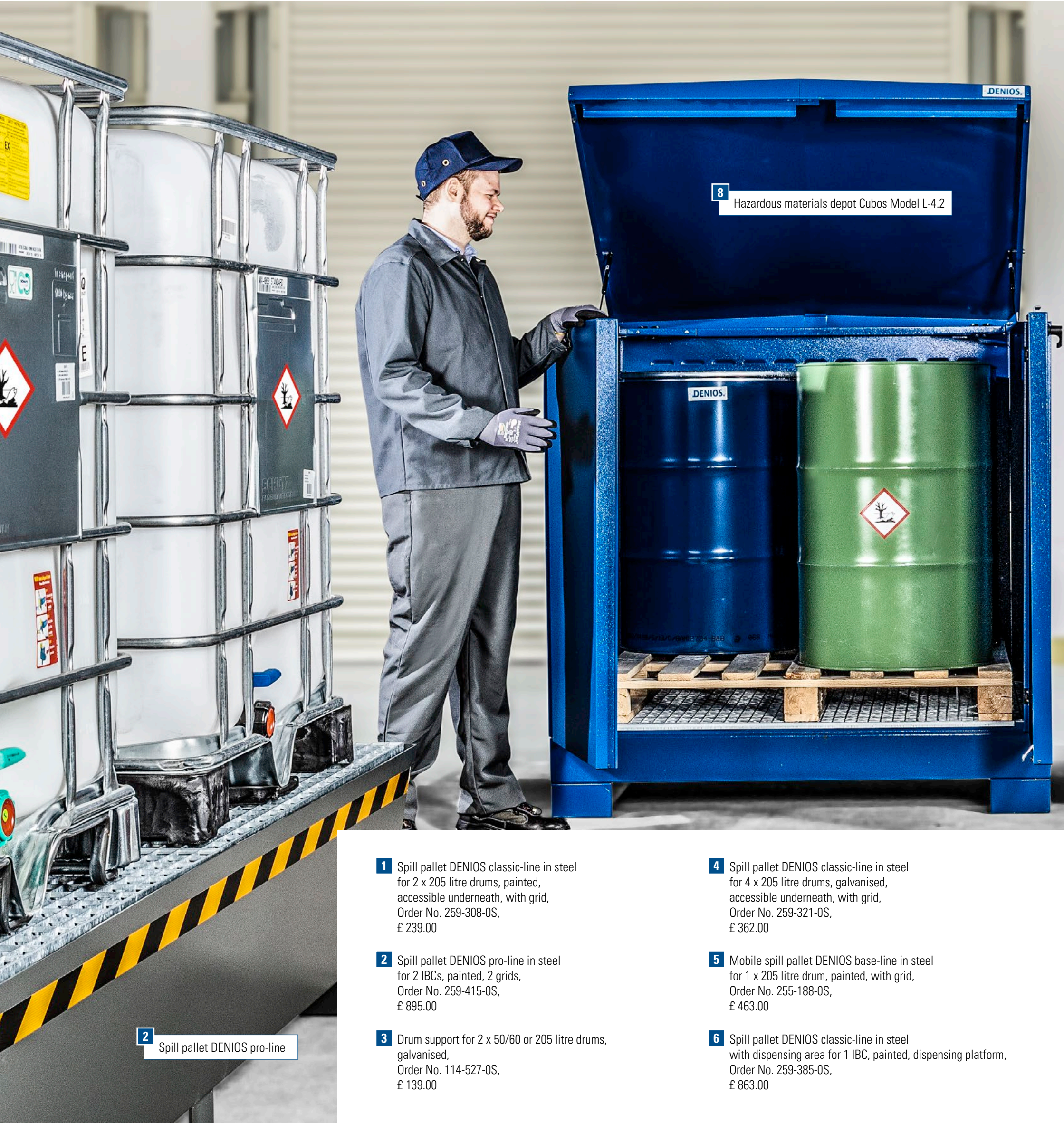
8 Hazardous materials depot Cubos Model L-4.2