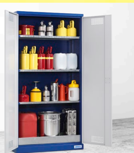
2 Chemicals cabinet Easy

3 Chemicals cabinet Protect, W (mm): 1000, incl. floor spill pallet and 3 spill trays, Order No. 201-960-0S, £ 406.00